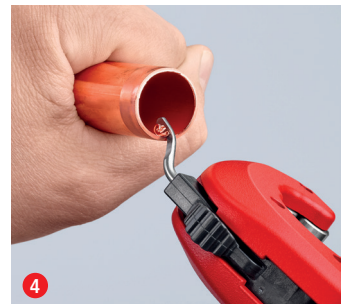
4 and you're done! If necessary, have the edge smoothed out using the fold-out deburring tool – with surprisingly little effort