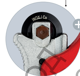
The needle-bearing and spring-loaded cutting wheel made of high-quality ball bearing steel is easily exchangeable