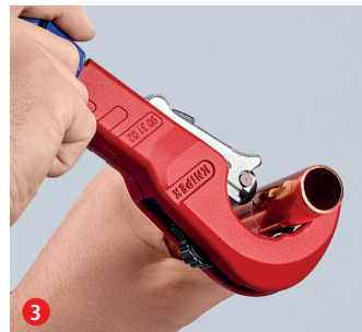
3 Tighten and cut with a swift twist and then readjust using the ergonomic blue feeding barrel...