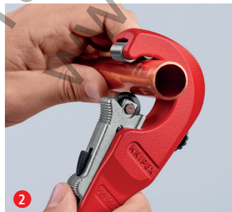
2 Push the cutting wheel against the pipe with the QuickLock single hand quick adjustment: fastest adjustment to different pipe diameters