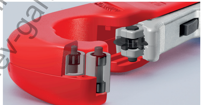
High-quality needle bearings enable the cutting wheel and the four guide rollers to operate virtually without any friction during the cutting – cuts stainless steel pipes with particular ease