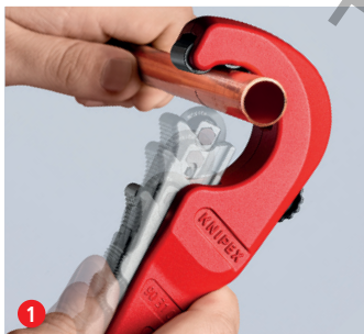
1 Cutting now made easy: position the opened KNIPEX TubiX®...