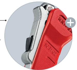
The spring-loaded cutting wheel can be pushed and fixed on the diameter of the pipe with the single-handed quick adjustment